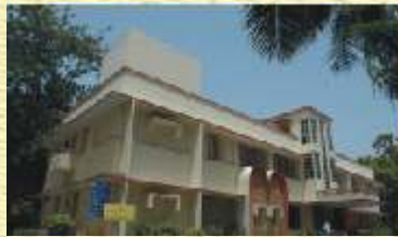
Navasuja Sankara Nethralaya