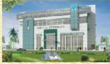
Sankara Nethralaya - Kolkata