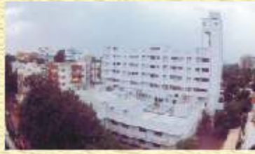
Jagadguru Kanchi Shri Chandrasekarendra Saraswathi Nethra Nilayam (JKCN)