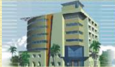
The Kamalnayan Bajaj Institute for Research in Vision and Ophthalmology