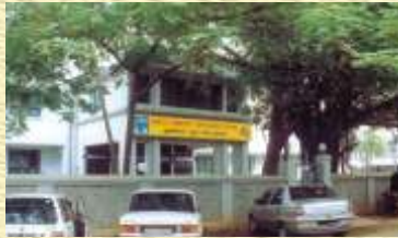
Jaslok Community Ophthalmic Centre