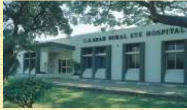
C.U. Shah Rural Eye Hospital